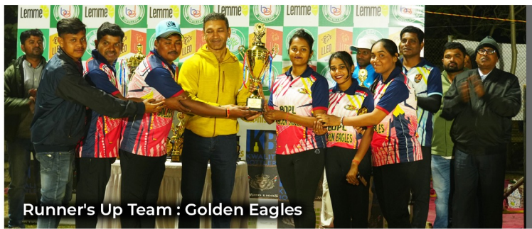
Runner's Up Team : Golden Eagles