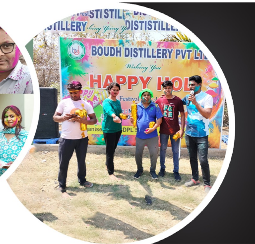
March 4, 2026; Boudh & Kwality Bottlers