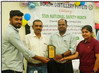
Best department for Best Safety Practices - Electrical