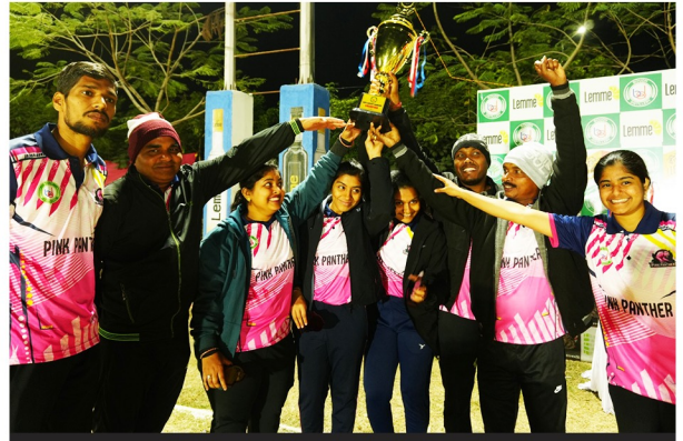
BDPL Cricket Premier League 2026 Women's Team Champions - Pink Panthers