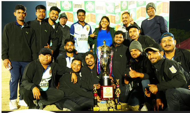
BDPL Cricket Premier League 2026 Champions - BIPL Smashers