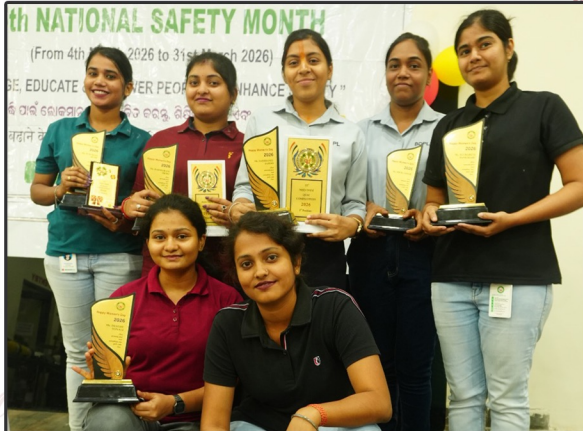
Empowered Women of BDPL Family