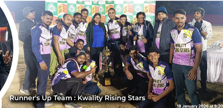
Runner's Up Team : Kwality Rising Stars